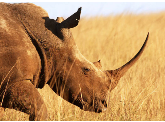
...a market for ivory still exists in the United States...

To counter the outcry from the NRA about attempts to restrict commercial sales of animal parts and ivory-handled guns, bill proponents point to recent case law upholding similar restrictions. In Asian American Rights Committee v. Brown, 2012 WL 11891478 (Cal. Sup. Ct., July 23, 2012), a state prohibition on